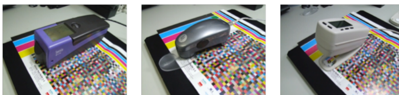
Figure 1: Left to Right: SpectroEye, i1Pro, 530

In 2006, the two leaders in the field of color science and technology, X-Rite and GretagMacbeth, merged to form the new X-Rite, Inc. The former X-Rite and the former GretagMacbeth each had, for historical reasons, different calibration standards for graphic arts instrumentation. Both companies maintained their standard over time to guarantee the compatibility of measurement data with their instruments for their customers. The continuity of standards was a benefit to each company’s customer base, but instruments from each of the former companies exhibit systematic differences on a given sample. It is the goal of the new X-Rite that inter-model color agreement is optimized for advances in color science so that all of our customers – regardless of their legacy affiliation - can enjoy high quality data exchange between sites that use different instrumentation.